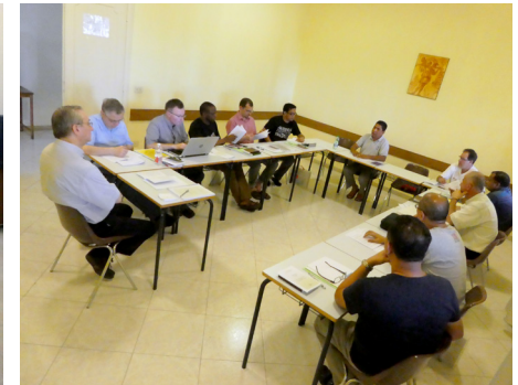
2nd Commission – Religious Life and Formation