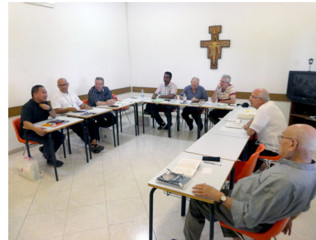
1st Commission – Chapter Document.