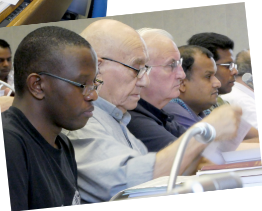
The Chapter Assembly.