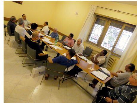
3rd Commission – Mission and Apostolate.