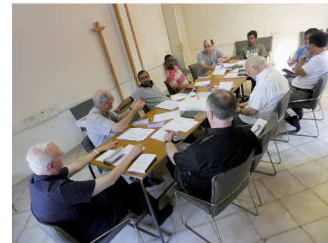
5th Commission – Administration of Goods.