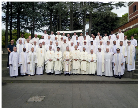
The Members of the XII General Chapter.