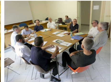
4th Commission – Structure and Government.