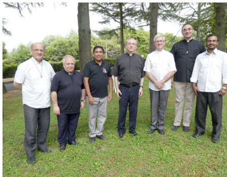
The new set of General Government.