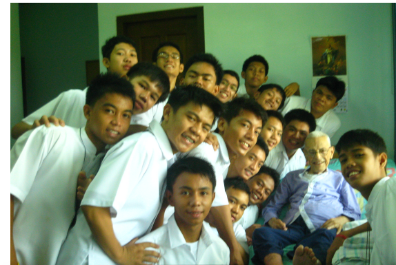
With some visiting seminarians...

He remained faithful to the rhythms of community life until the end, always wearing a smile, centered on the Lord, and concerned for his confreres and for his “beloved Congregation”,