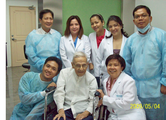
With the attending medical staff at the Epeius Clinic, Alabang

In April 2009 he was diagnosed with a malignant tumor which he overcame with patience and with the help of a new “gene therapy”. He endured the pain with heroic patience and serenity entrusting himself completely in the hands of the will of God, as he had always recommended to his spiritual children. During his illness, he lovingly welcomed patients, doctors and those who wanted to hear from him a word of comfort or simply receive his blessing.