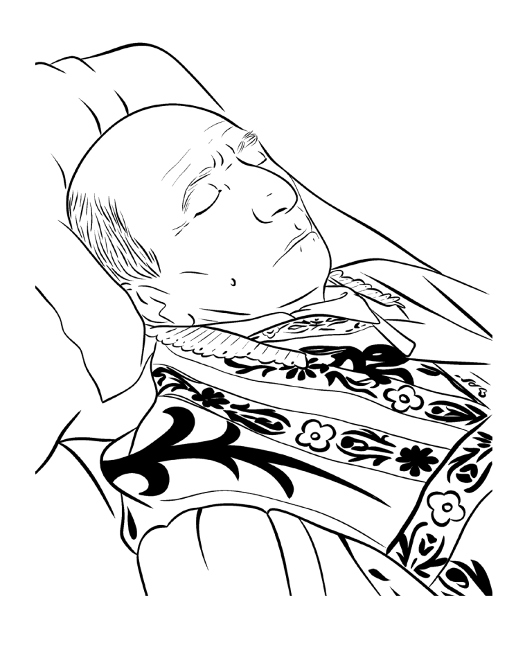
COMMEMORATION OF THE BLESSED TRANSITUS OF ST. HANNIBAL MARY